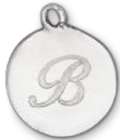
1 INITIAL IN SCRIPT

Loveprint Jewelry is committed to quality and service. Each Loveprint Jewelry piece is handcrafted, from start to finish.