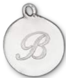
1 INITIAL IN SCRIPT

Loveprint Jewelry is committed to quality and service. Each Loveprint Jewelry piece is handcrafted, from start to finish.