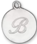
1 INITIAL IN SCRIPT

Loveprint Jewelry is committed to quality and service. Each Loveprint Jewelry piece is handcrafted, from start to finish.