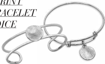
Deco bracelet with one round print

Wire adjustable bracelet with one round print